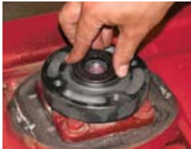
7. Install the hardened splined washer.