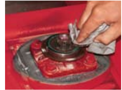
5. Remove filings.