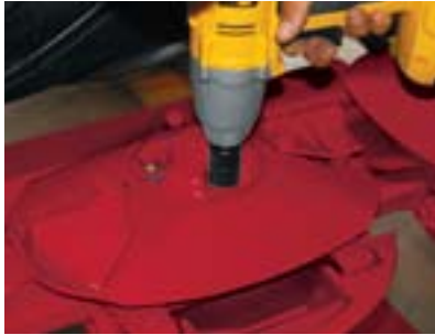
1. Remove 4 bolts. Then lift the disc off.