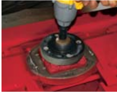
2. Remove center bolt.