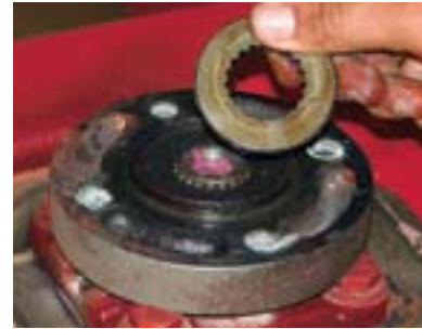
4. Remove hardened splined washer and ShockPRO™ hub.