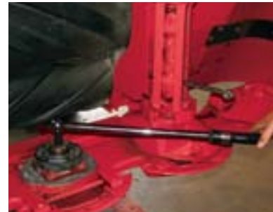
9. Torque the center bolt to 135 ft-lbs.