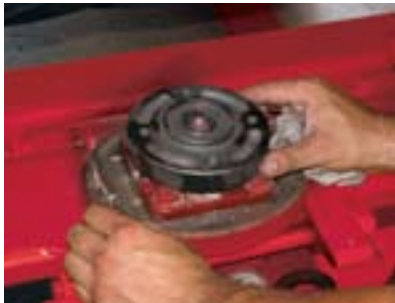
6. Replace the ShockPRO™ hub, so that when the disc is installed, it is positioned 90° relative to the next disc.