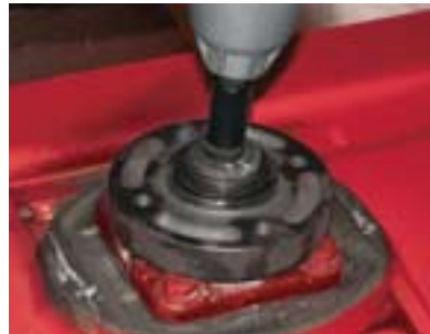
8. Install the washer and center bolt.