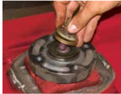
3. Remove center bolt and washers.